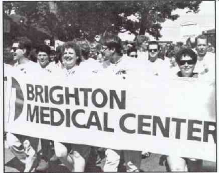
Brighton Employees enjoying Walk!

72 Brighton employees were among the 6000 participants in the United Way of Greater Portland's Kickoff Walk as a show of community support for the program. As Rounds goes to press, Brighton was nearly at our goal of raising $15,000. Special Thanks to all Brighton employees who donated to this deserving cause.